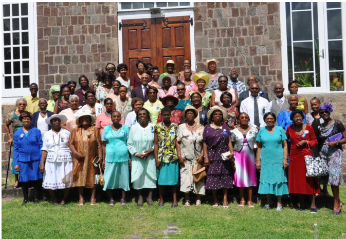
Members of the Moravian Senior Club

She saw the need for a ministry that would embrace retired members of Zion, both male and female, and engage them in meaningful activities that would enrich their years of retirement while they were still active. She was able to persuade a target group to meet and discuss the ideas she had, as well as to give some of their own, and gradually the seed took root.